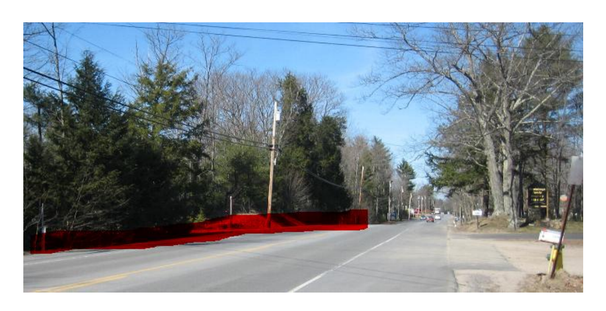
Long road frontage on busy Route 1 in Arundel, ME. Located approximately ½ way between Biddeford & Kennebunk.

Contact Wally Flaherty 207-985-4977 X 46